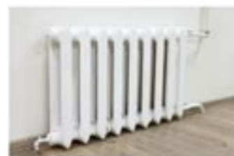
Figure 1.22 A domestic radiator contains water which is heated by a boiler.