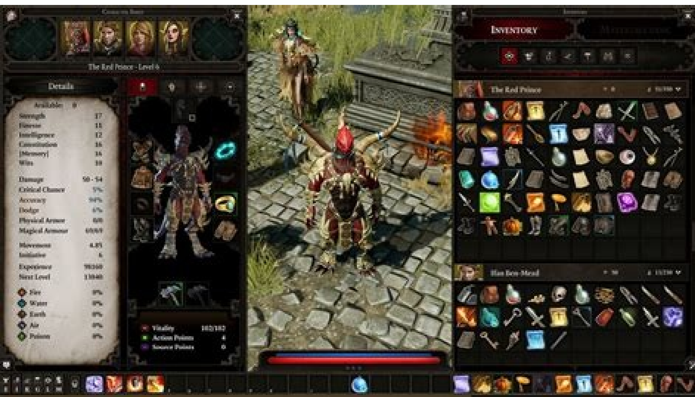
Divinity original sin 2 build calculator.